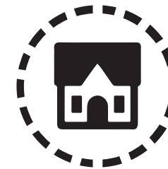
DOTTED CIRCLE [hosts]