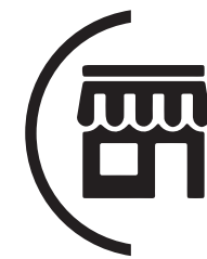
HALF CIRCLE [guests]

“The Church is to move from gospel presentation to kingdom presence”. This emphasis on “faithful presence” as seen in Luke 10, the sending of the 72, gives us a poignant image of “eucharist on the move, extending the presence of Christ into the world.”