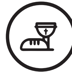
CLOSE CIRCLE [recipients]